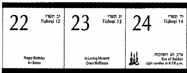
Sample calendar date space

Please include business card, camera-ready ad or print the text of your message below. If necessary, type ad on a separate paper.